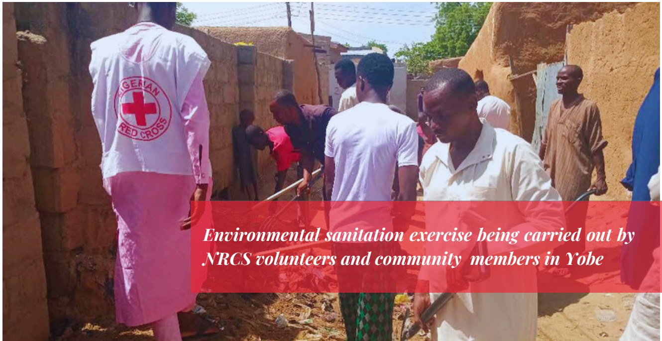
Environmental sanitation exercise being carried out by NRCS volunteers and community members in Yobe

In July 2025, the International Committee of the Red Cross (ICRC), in partnership with the Nigerian Red Cross Society (NRCS), conducted a hygiene campaign across Bade, Damaturu, Geidam, and Gujba LGAs in Yobe State. The initiative focused on cleaning exercises, hygiene promotion, and sensitization to prevent cholera and improve menstrual hygiene awareness.