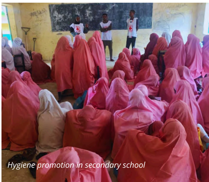
Hygiene promotion in secondary school

Over 1,500 individuals and 709 households were reached through community outreach. In Filin Kurma and Shuwari, household visits engaged families with key hygiene messages, while in Tsangaya and Sunomari, house-to-house sensitization accommodated farming schedules, reaching 108 households. At TA'ALAWA, 702 individuals participated in targeted sessions.