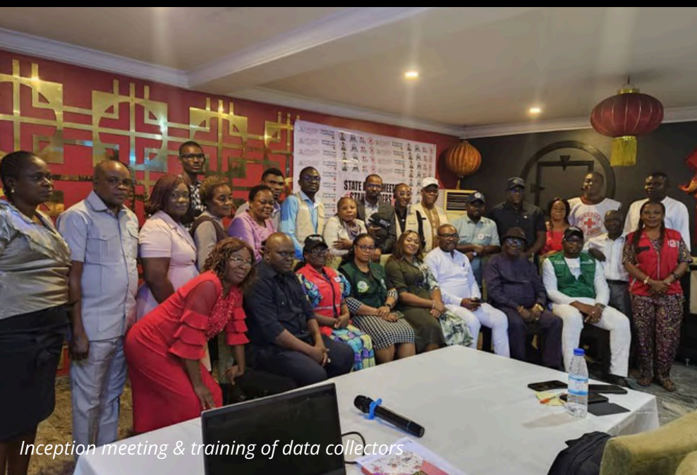
Inception meeting & training of data collectors

The Saving Lives and Livelihoods is a $1.5 billion partnership between the Africa CDC and the Mastercard Foundation to save the lives and livelihoods of millions of people and hasten the economic recovery of Africa by procuring vaccines for more than 65 million people, supporting the delivery of vaccinations to millions more, and integrating into and supporting the delivery of routine immunization ensuring the strengthening of public health systems in Africa. The Saving Lives and Livelihoods initiative is assuring the long-term health security of the continent by developing the workforce for vaccine manufacturing in Africa and strengthening the Africa CDC.