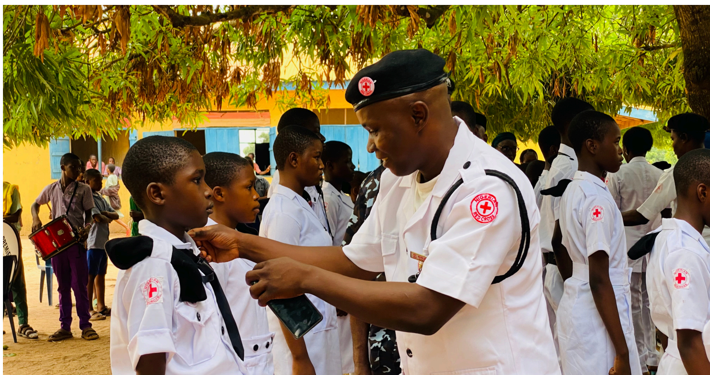
FIRST AID DEMONSTRATION, AND PRESENTATION OF THE RED CROSS FLAG TO THE SCHOOL