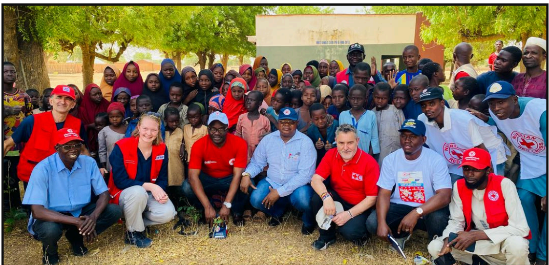
Norwegian Red Cross ERU, Secretary General of the NRCS & DM Director at Azare, Bauchi state to commission the boreholes built and reconstructed by the Nigerian Red Cross.