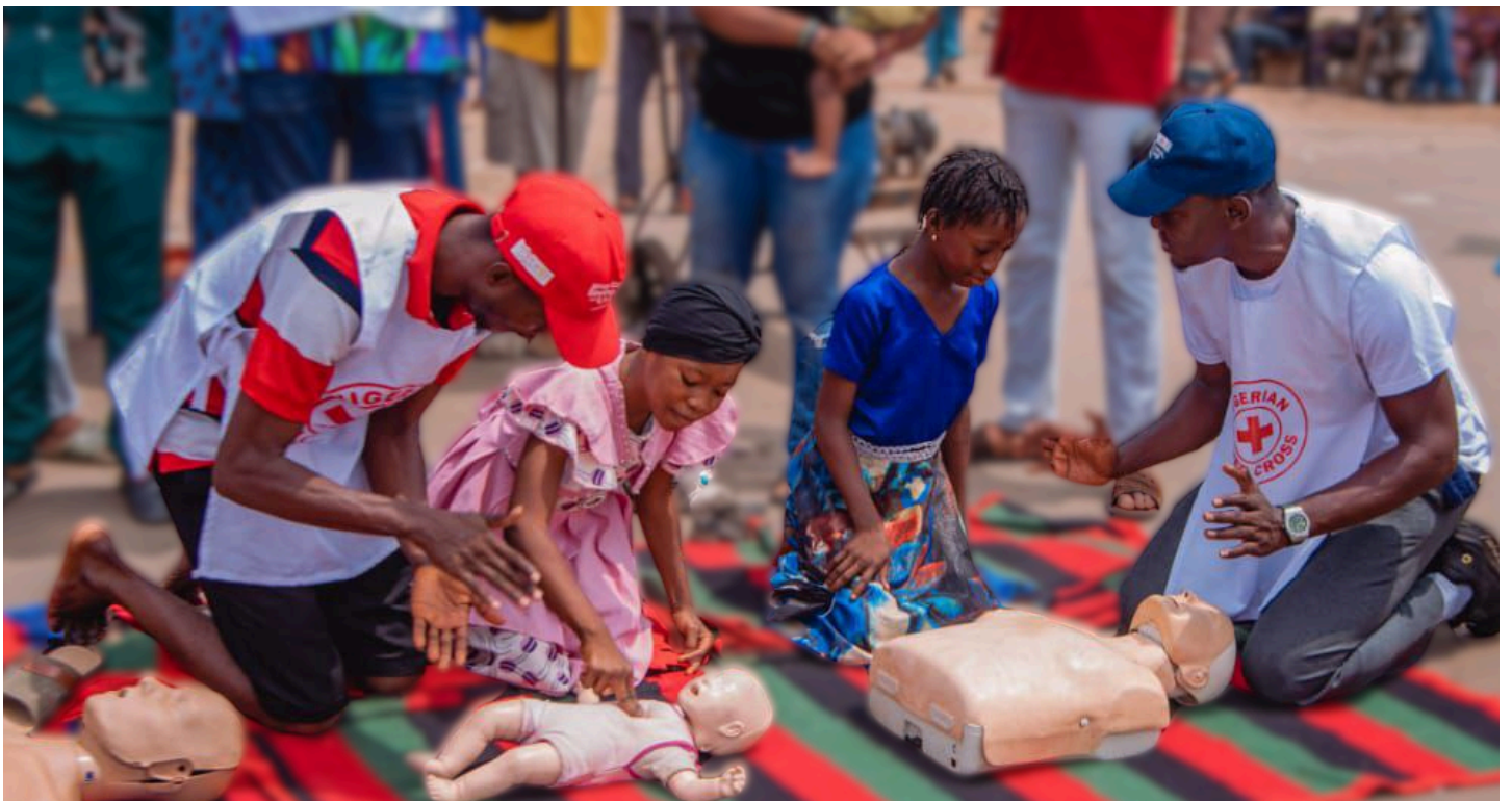
Children are shown how to administer Cardiac Pulmonary Massage on an unresponsive baby/adult using a dummy

The initiative focused on promoting first aid awareness and providing basic emergency response training, engaging traders, commuters, and residents while strengthening local partnerships and increasing the visibility of the Society across the South West Zone.