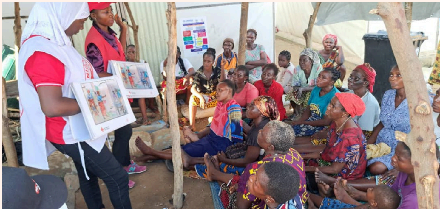
NRCS BENUE Branch Community Base Surveillance CBS volunteers sensitizing the IDPS in ichwa camp Makurdi