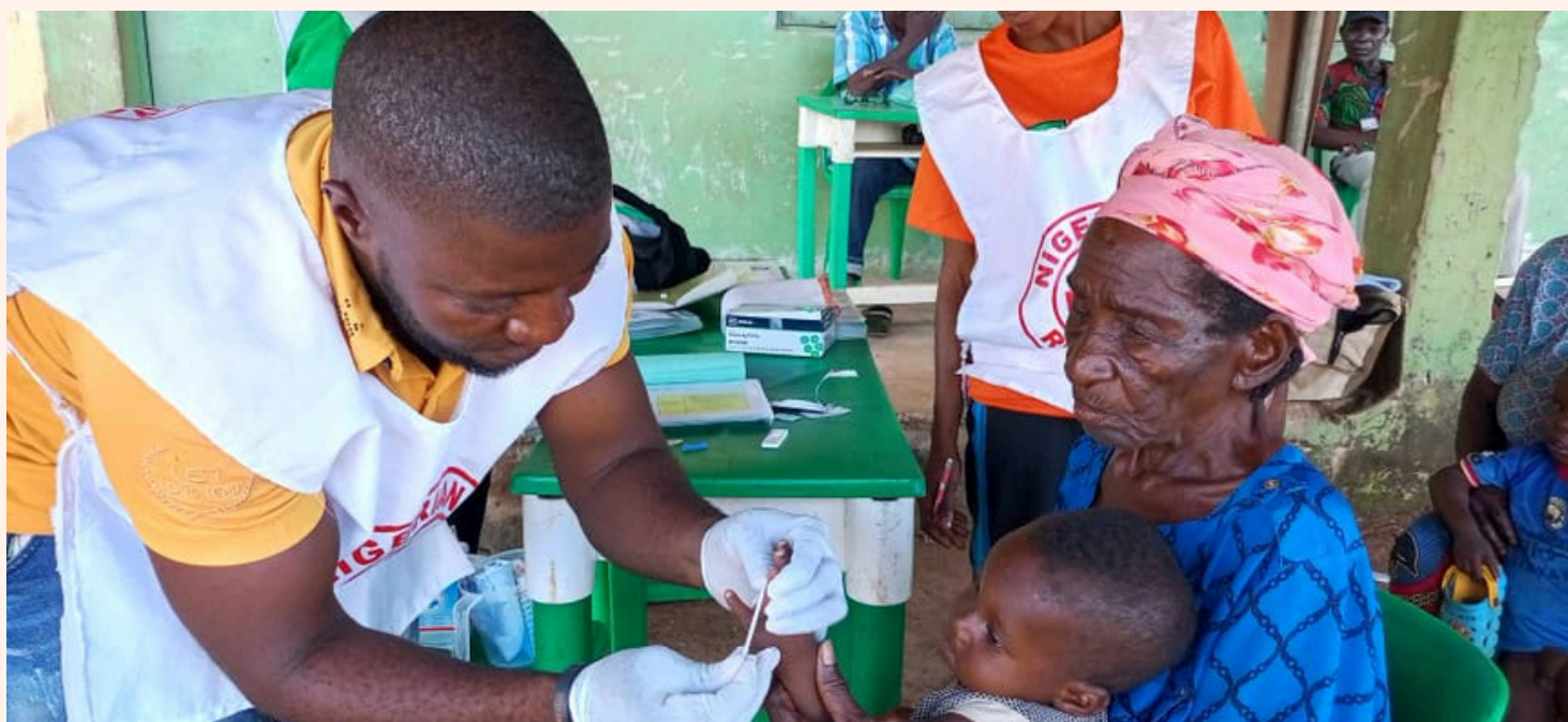
NRCS BENUE Branch iCCM volunteer in Community Health Project funded by NoRC is collecting a blood sample from a child with malaria symptoms to conduct RDT for malaria before administration of antimalarial drugs if the result is positive .