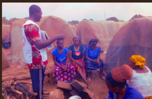
Community Based volunteer, Gwer-West Division Benue Branch Sensitize IDPs on hygiene promotion