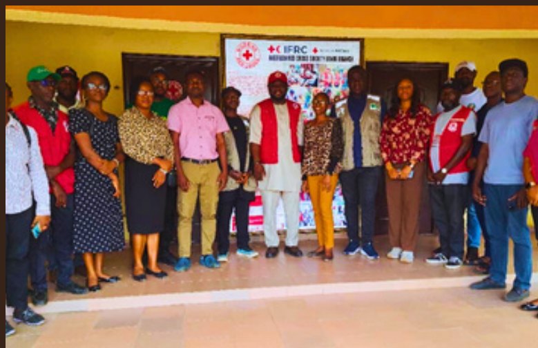
NCDC and MoH state team pay Advocacy to Red Cross to deliberate on how to combat Lassa fever